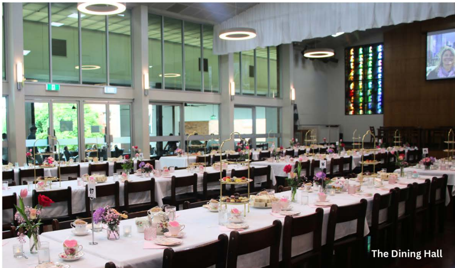
The Dining Hall