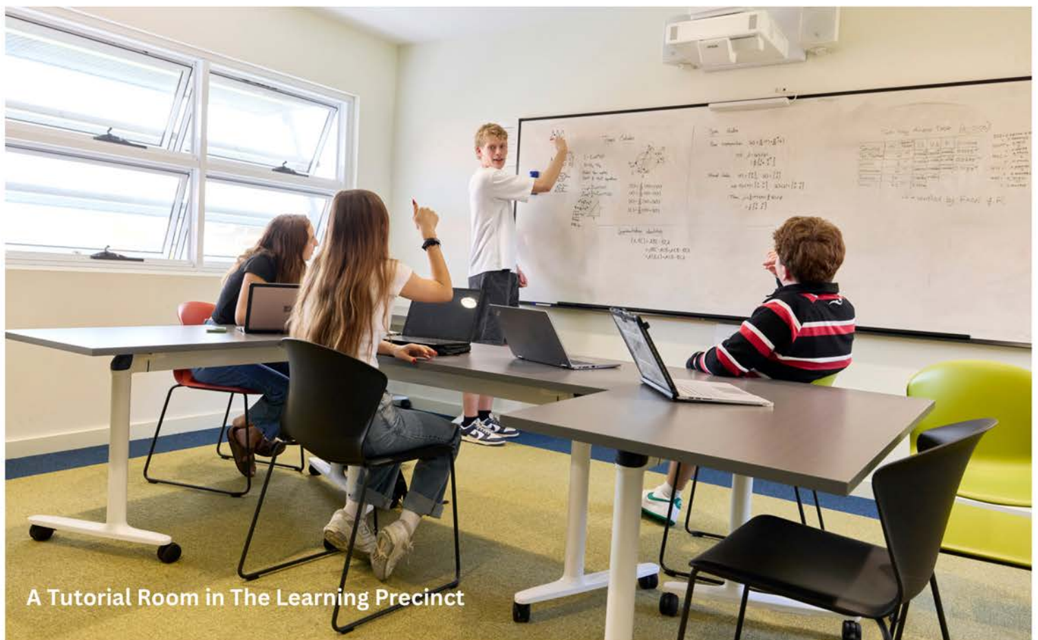
A Tutorial Room in The Learning Precinct