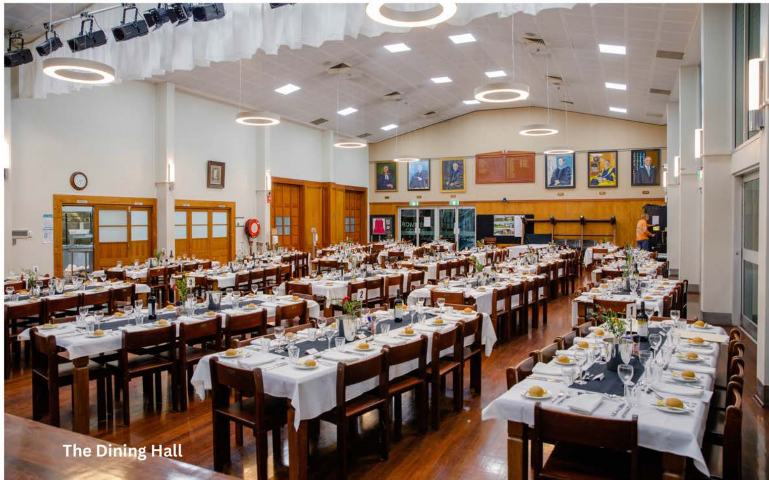
The Dining Hall